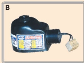
IP - 65 & IS:2147 (for Weather Proof)